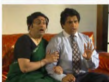
A Thousand Apologies - First Episode