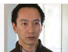
Open Door - New Zealand Chinese