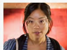
My Wedding and Other Secrets

Film, 2011 (Trailer, Excerpts, and Extras)