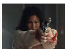
Do No Harm