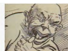
Frontline - Racist Revival