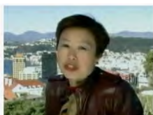
An Immigrant Nation - The Footprints of the Dragon