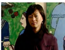
Here to Stay - The Chinese