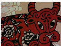
Asia Downunder - Chinese New Year, Year of the Ox Lantern Festival