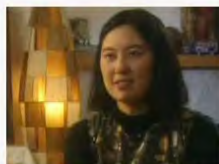
Our People Our Century - Being Kiwi