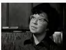
Gallery - The Chinese Community