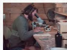
Contact - Chinaman's Gold