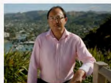
Neighbourhood - Gisborne