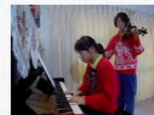
Frontline - Class Act