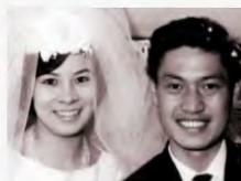
Eating Pork'n'Puha with Chopsticks