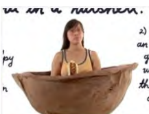
Banana in a Nutshell

Film, 2011 (Trailer, Excerpts, and Extras)