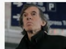
The Red House