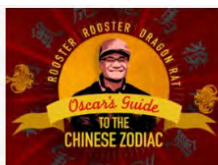
Rooster Rooster Dragon Rat - Oscar's Guide to the Chinese Zodiac