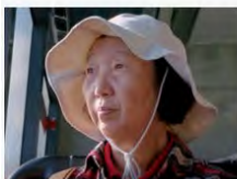
Loading Docs 2017 - East Meets East