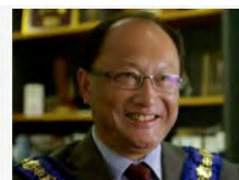
NZ Story - Meng Foon