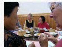
New Faces Old Fears