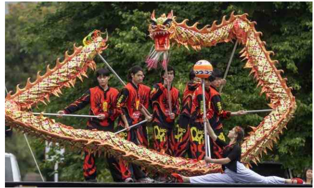
Welcome the New Year of The Snake – Qiao Yi Hong De Lion Dance Team