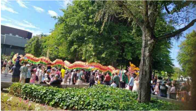
Longest parade dragon in South Island makes its way through Victoria Square. Thank you to our NZCA members who came to support it for the parade!

The Christchurch Lunar New Year Parade followed by cultural performances was held on Sunday 26 th January at Victoria Square as the official welcome to the New Year of the Snake, which began on 29 th January and will end on 16 th February 2026.