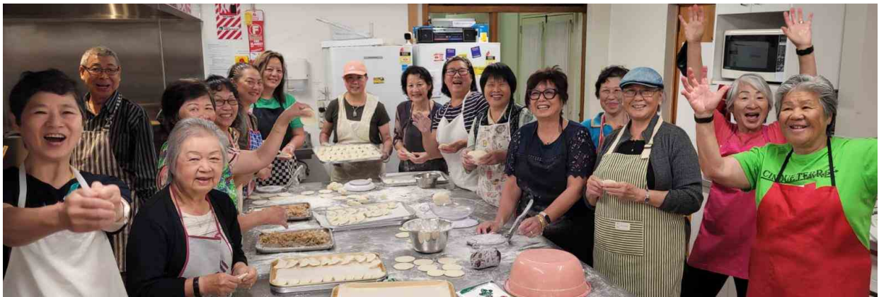
Making traditional New Year dumplings