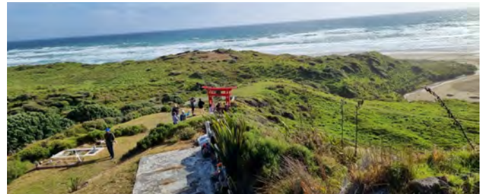
WCA Chinese New Year—Feb 2024