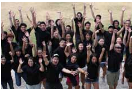
Pg 10 NZCA LDC 2011