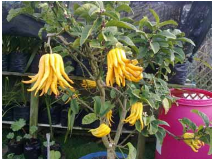
Buddha's Hand in full bloom.

Large trees such as oak, pine, cypress, spruce, juniper, pohutukawa and kowhai, et al. are wired and reduced to fine forms of living art. You can tell some are very old by their gnarled and fascinating looking roots. Old Bonsai are very valuable and command a premium price as it takes years to get them looking mature.