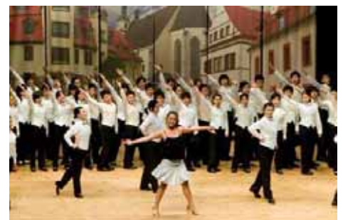
Pg 13 Yip's Children's Choir