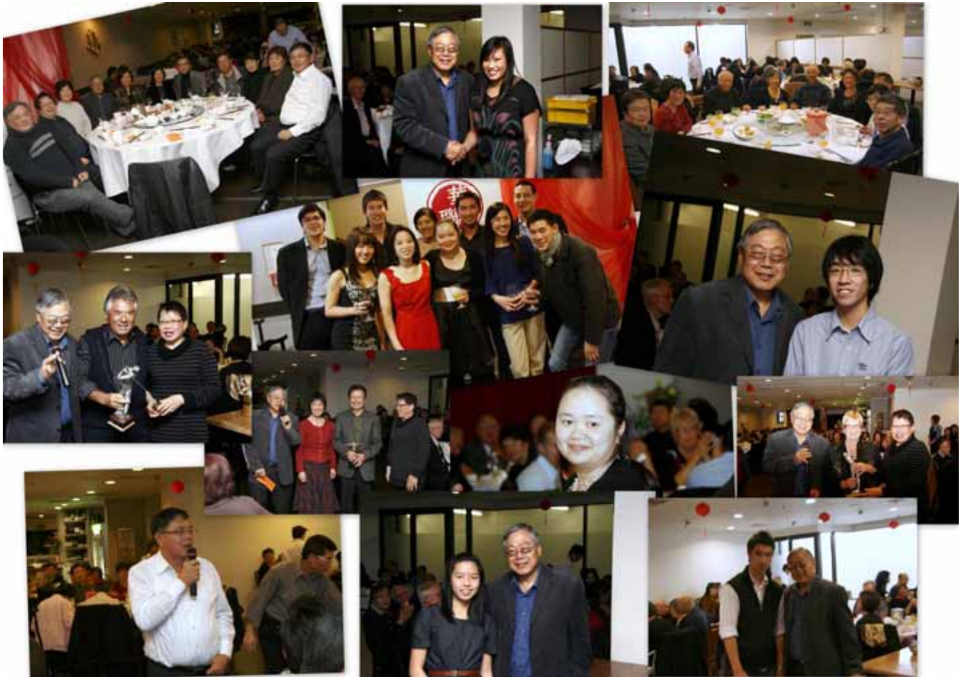
A celebration of sporting and academic achievements at the NZCA 75 th Anniversary Dinner