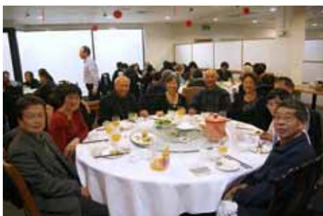
Pg 5 NZCA 75 th Anniversary Dinner