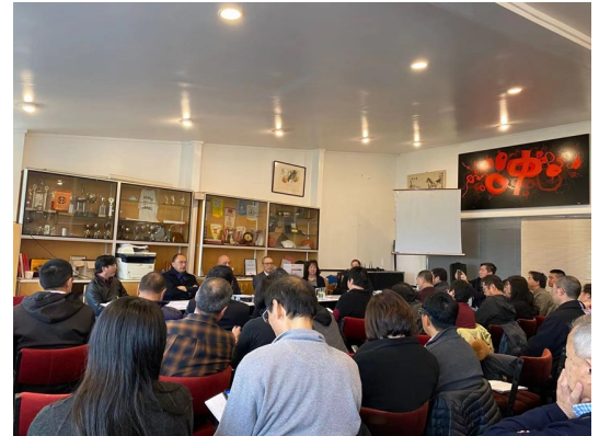
Representatives from Taiwan Economic and Cultural Office, NZ

The meeting was an occasion to connect with the national association and other branches. It was also a great opportunity to learn and get inspiration for what we can do in our branch.