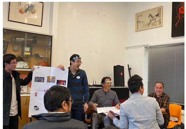
Connect NZCA's history with big times – meetings can be great fun